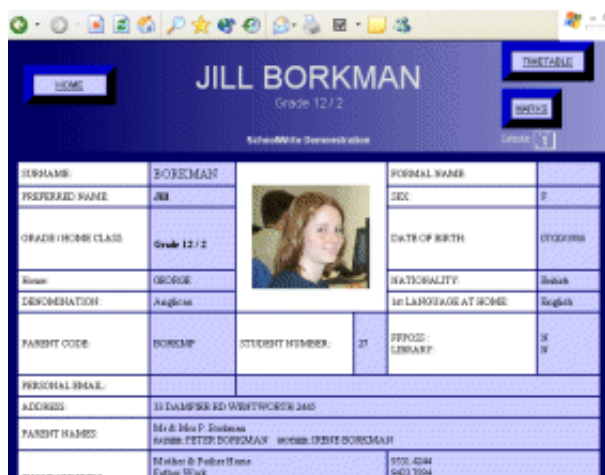
Intranet pages of student details are automatically kept up-to-date.

Included with the Students module is the SchoolWrite Intranet . When student photos are included this becomes an vital tool for quick information on students throughout the school.